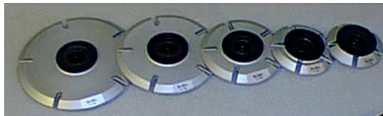
Model FL driving heads