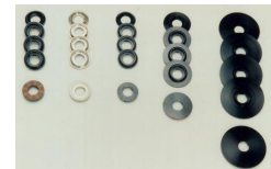
Adding plates & diamond discs